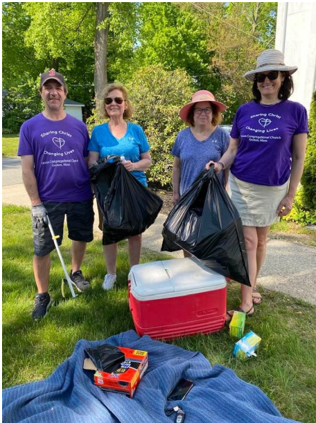
Block Party Clean Up