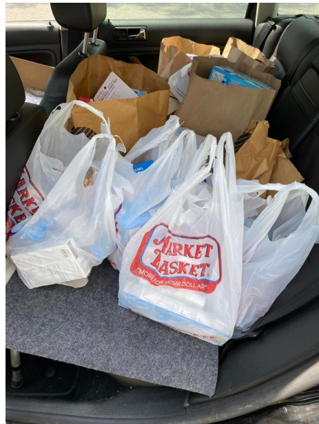
Donations for Ukraine

Facebook saw these photos first! Join our new church Facebook group! www.facebook.com/groups/uccgroton