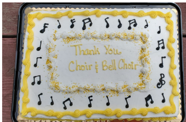
Music Appreciation Cake

Facebook saw these photos first! Join our new church Facebook group! www.facebook.com/groups/uccgroton