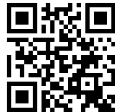
Join Our Email List