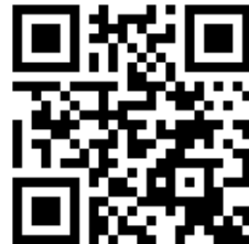
Join Our Email List